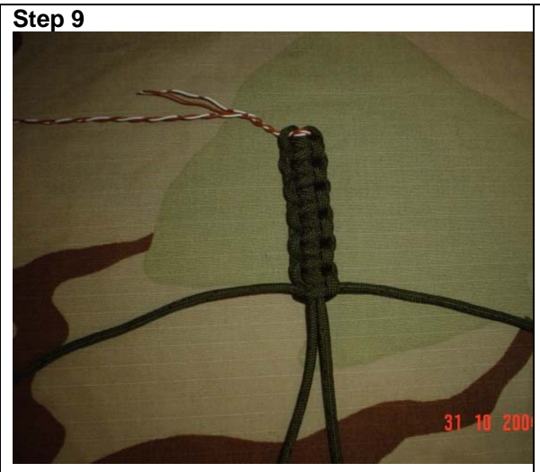
As you can see now the bracelet is taking a nice shape.