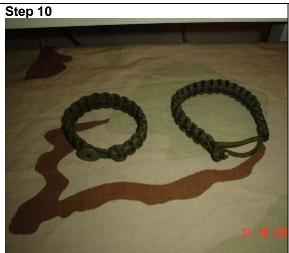
I've been using two methods in securing the bracelets