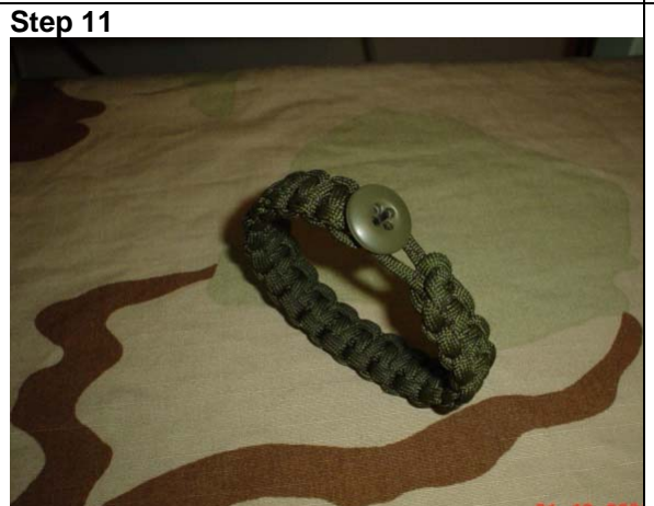
By using a button to keep it secure and...