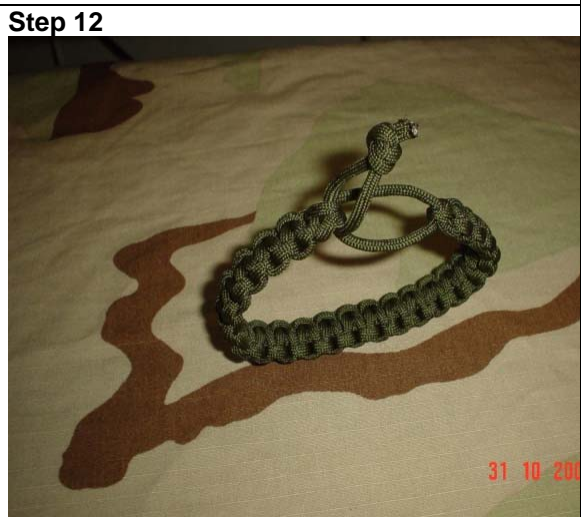
By using just the rest of the cord.